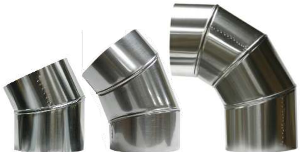
0-30 degree 290mm or 590mm long

For situations that require a more convoluted configuration these Vegalux™ adjustable angles allow for almost any installation to be possible whilst the 99.7% reflectivity ensures that minimal light is lost.